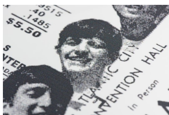
MDF chassis and high quality print