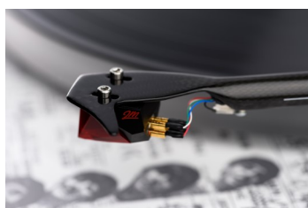
Ortofon 2M Red

We have already introduced the George Harrison Recordplayer and are now showing the world our second limited edition turntable. It features copies of original tickets and brochures from their legendary touring between 1962 and 1966 during which they captured the world's acclaim! The fab four have held 166 concerts in 15 different countries and 90 individual cities in only four years. The cultural phenomenon their touring helped create, known as „Beatlemania“, was something the world has never seen before and laid the foundation for the globalization of culture. We decided to use one of the most sold audiophile turntables ever for this unique design - the Debut Carbon Esprit SB. It features highest quality audiophile components, such as an Ortofon 2M Red, an acrylic platter, a carbon tone-arm, a top notch MDF chassis or built-in electronic speedcontrol for easier switching between playback speeds. Main features of Pro-Ject The Beatles 1964 Recordplayer: