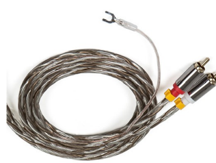
Connect it E