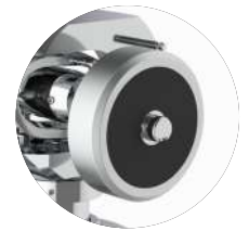
TPE Damped Counterweight