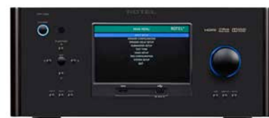
RSP-1582 7.1 Home Theater Surround Processor / Preamp